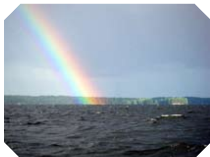
Left: A September squall produced a fine rainbow and several salmon too.