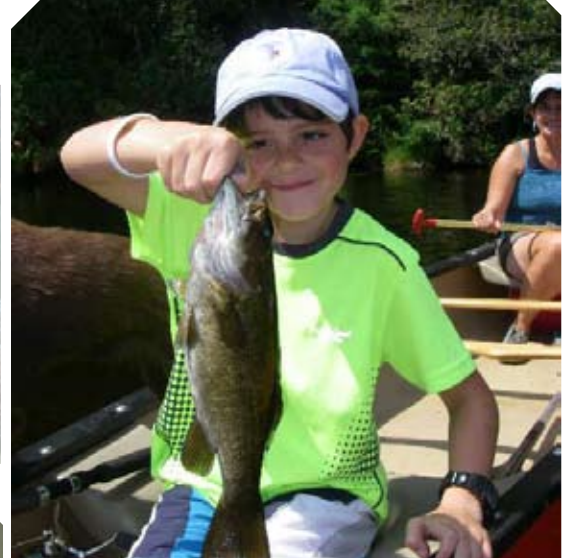
Kianu shows off a nice smallmouth