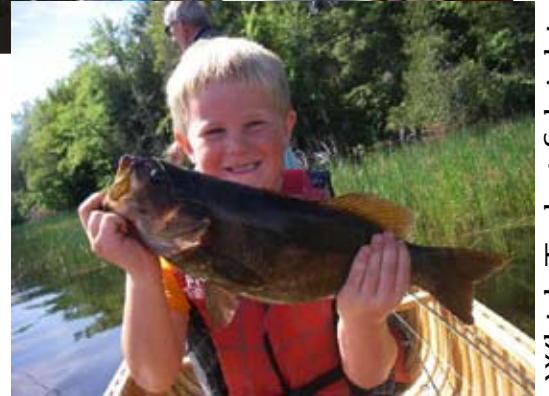
Which Techet fish is bigger?