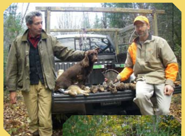
Molly after a fine hunt