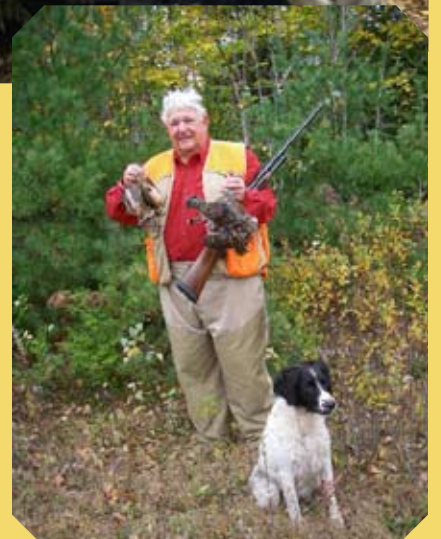
Mel with a brace