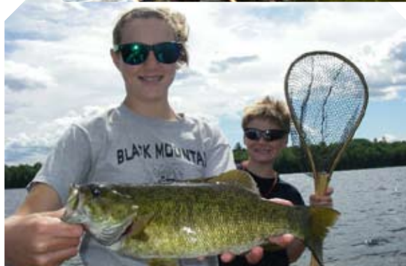
Teamwork helped land this one