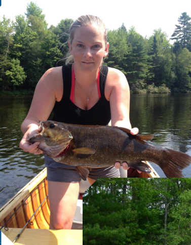
Courtney's 20 incher